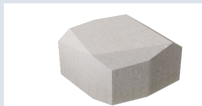
Single tile view