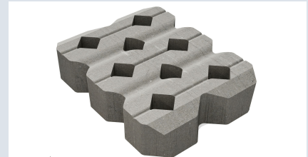
Single tile view